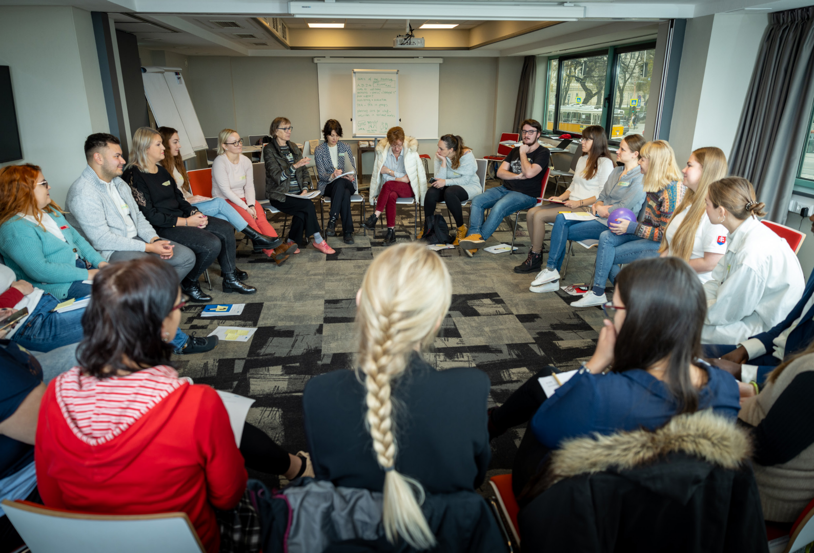
Caring for Staff and Volunteers training of trainers in Budapest, Hungary