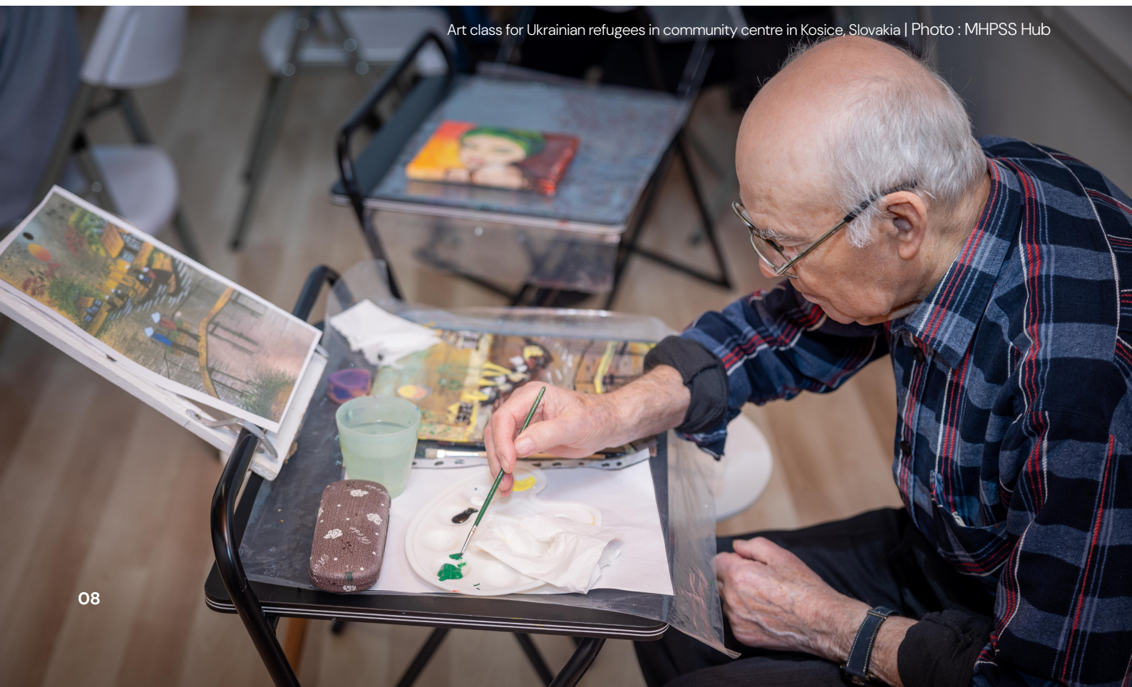
Art class for Ukrainian refugees in community centre in Kosice, Slovakia

strengthen the quality of MHPSS services across the National Societies implementing the project. Drawing on the Red Cross Red Crescent Movement MHPSS Framework , the Hub provides technical support, conducts humanitarian diplomacy with State Parties and international organizations, promotes best services, facilitates peer learning, and ensures the alignment of MHPSS services and programming with global standards. Through its collaborative and mentoring approach, the Hub plays a key role in building National Societies' capacity and competencies to design, implement, evaluate and research, community-driven MHPSS services delivered by volunteers and tailored to local contexts.