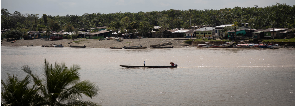
The Atrato River that runs next to Quibdó, the capital city of Chocó Department

To understand the main drivers of the humanitarian needs in the country, a visit to Chocó was conducted. Chocó is a department of Western Colombia that extends from the borders of Panama to Ecuador. This area is highly affected by climate variability, armed conflict, and displacement. Like other regions in Colombia, much of Chocó department is a battleground for armed groups, with increased confinement particularly amongst indigenous and Afro-Colombian populations living in secluded settings, most of them only accessible by river and already facing extreme poverty levels. This makes it easy for the non-state armed groups to seal off access of communities to the outside world, and more challenging for humanitarian aid workers to respond to the needs of affected communities. 4