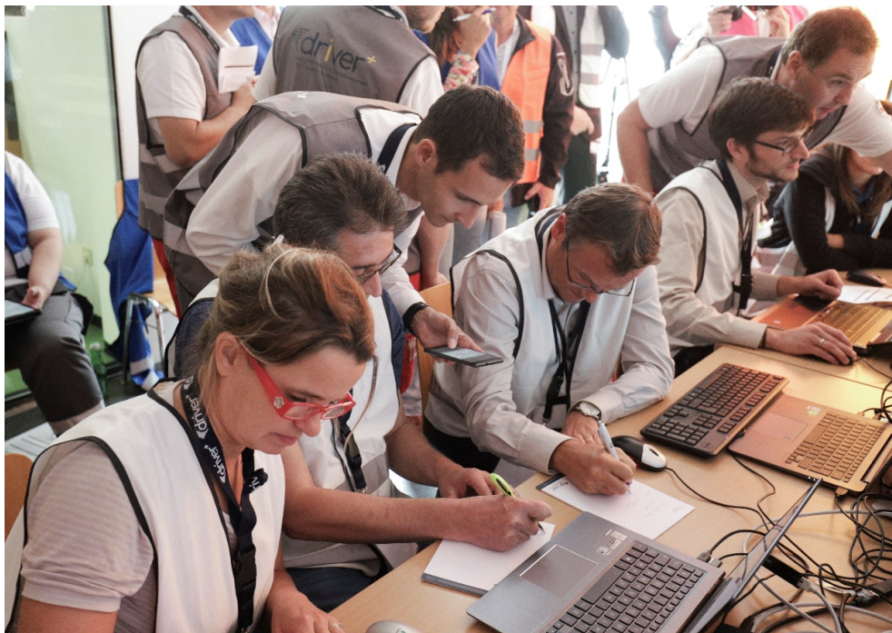
Trial Austria 2019