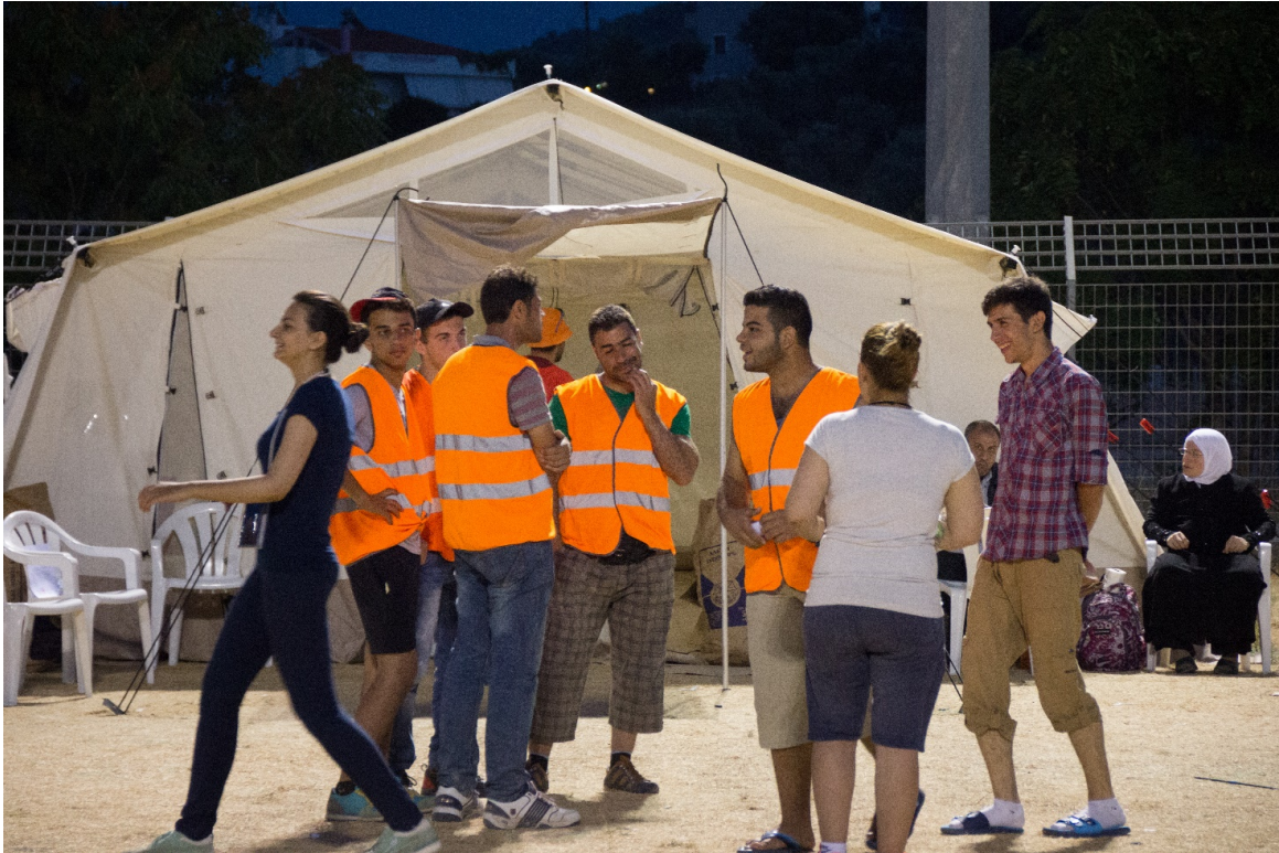
A group of around 20 young Syrian migrants has been volunteering side by side with the volunteers from the NGOs, including Hellenic Red Cross volunteers.