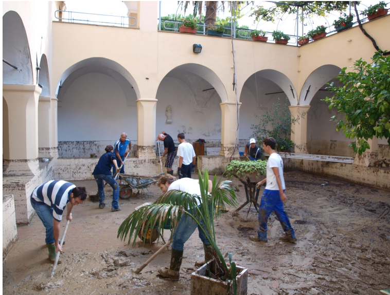
Unaffiliated spontaneous volunteers at Church of San Domenico, October 2010, Varazze, Italy.

due to their unaffiliated nature. While the on-site spontaneous unaffiliated volunteer may be approached physically, off-site digital volunteers are more elusive by nature.