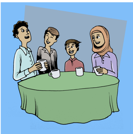
SPEND TIME WITH PEOPLE YOU LOVE