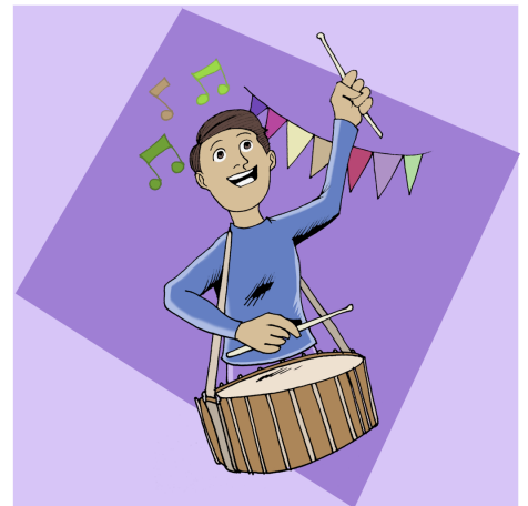
ENJOY THE OCCASIONS