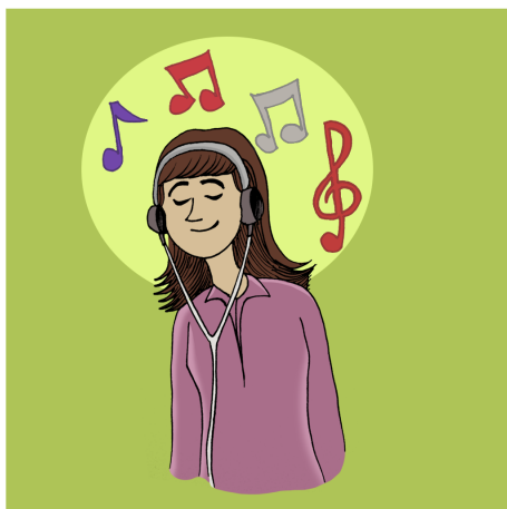
LISTEN TO THE MUSIC THAT YOU LIKE