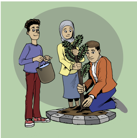
ENGAGE IN COMMUNITY AND FAMILY ACTIVITIES