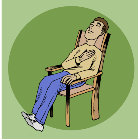
PRACTICE RELAXATION AND MEDITATION