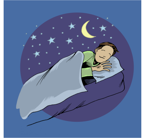
REMEMBER TO REST