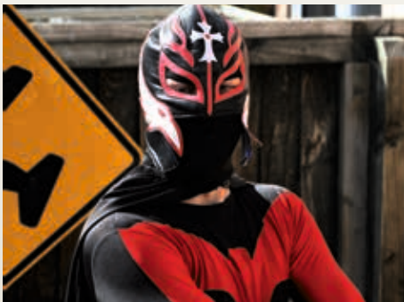
Local superhero Flat Man explains what inspires him to be "a bruv and share the love" at www.addressthestress.co.nz/videos/flatman

A disaster of this magnitude makes recovery difficult. In itself, one earthquake is a serious disaster, causing suffering and stress. But the series of Canterbury earthquakes and aftershocks over an extended period of time caused on-going fear, suffering and stress. New Zealand Red Cross has been providing psychosocial support and practical assistance to the community since the first earthquake.