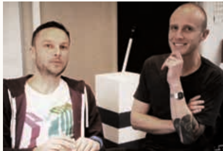
"Hang out with friends" is the sage advice from comedians, and good mates, Jono and Ben who share useful tips for dealing with stress at www.addressthestress.co.nz/videos/ben-and-jono

sages from some of New Zealand's top sports heroes, musicians, comedians and actors as well as young Cantabrians and experts in trauma recovery.