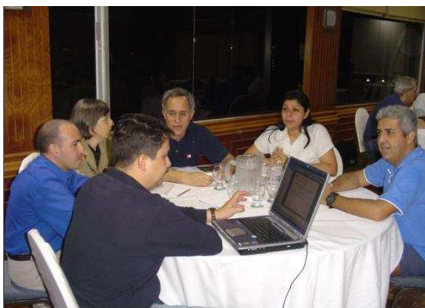
Towards a Regional Psychological Support Plan – NS Working Group Annual Meeting of Health and Relief Managers - Cartagena

The Psychological Support Policy (PSP) is based on the International Federation's Strategy 2010 and its Health Policy. The PSP was approved by the International Federation's Governing Board in May 2003 in Geneva, Switzerland. It establishes a basis for action both in emergency response operations and in the implementation of long-term developmental programmes. The programme is primarily designed to enhance the resilience of the population and to maintain the health, well-being and effectiveness of volunteers, based on active involvement of the public, networking and community-level contacts. The NS develop psychological support projects and activities as part of their regular emergency operations. However, this component should also be included in health programmes, providing staff and the groups affected with psychosocial support that strengthens their capacity to cope with emergencies.