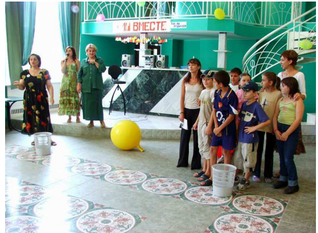
Sports and games were part and parcel of the "How we Spent the Summer" party for the children of Beslan.