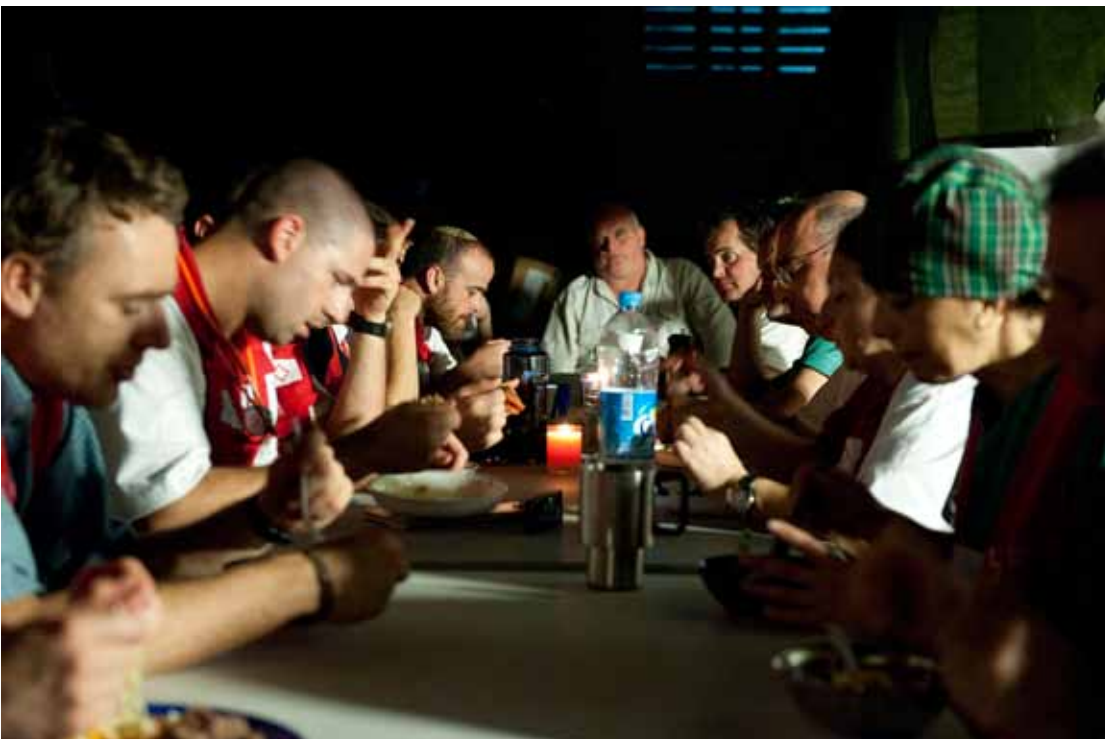
Red Cross medical teams from Norway, Canada, Israel and Haiti are in action at a polyclinic, sergical rooms and specially trained volunteers attending to both patients as well as hospital personells psychological needs after the earthquake.

pedestrians, I finally managed to find my way to the headquarters of Magen David Adom (MDA), the National Society of Israel, located in Tel Aviv. I sensed I had been heading the right direction,