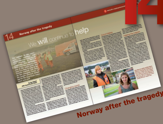
Norway after the tragedy