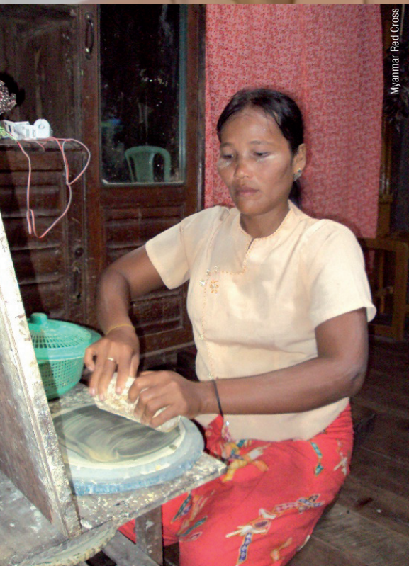
Myanmar Red Cross