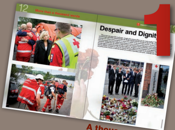
A thousand words