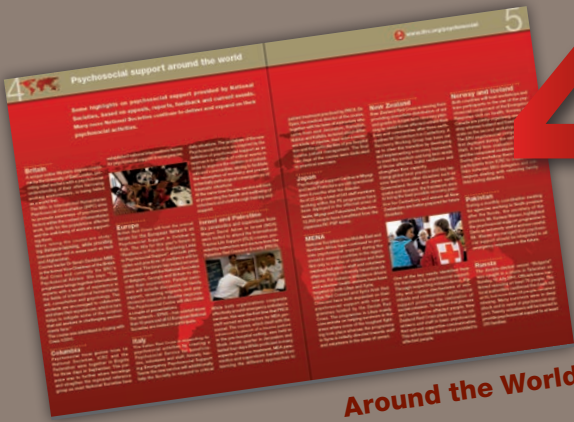
Around the World