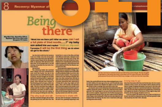
Focus on Recovery