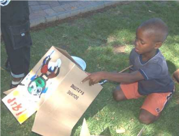
Child in Namibia painting memory box

the same time through memory work people living with HIV and AIDS have been encouraged to value life and look forward to the future.