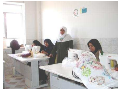
Distribution of family kits, sewing classes, and activities for women and artwork were among the psychosocial activities discussed at the workshop.